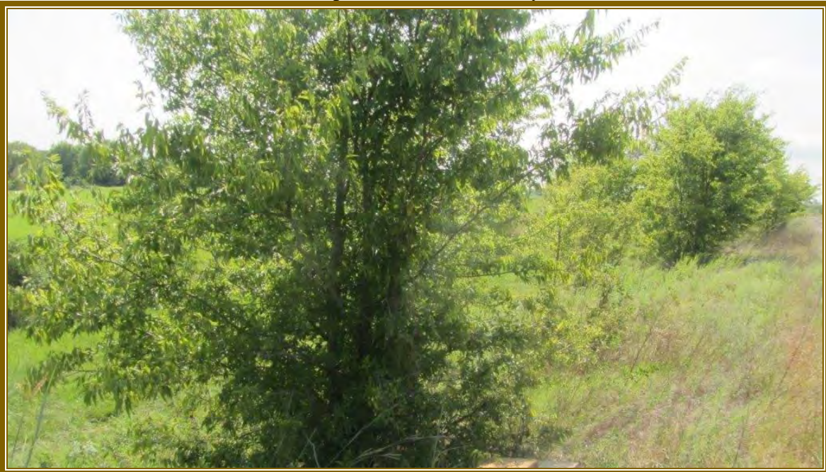
ABB Trap 4 and Habitat Surveyed