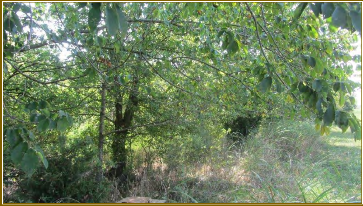
ABB Trap 3 and Habitat Surveyed