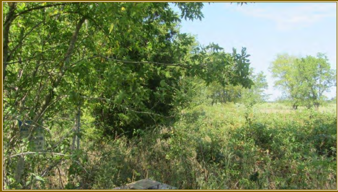
ABB Trap 1 and Habitat Surveyed