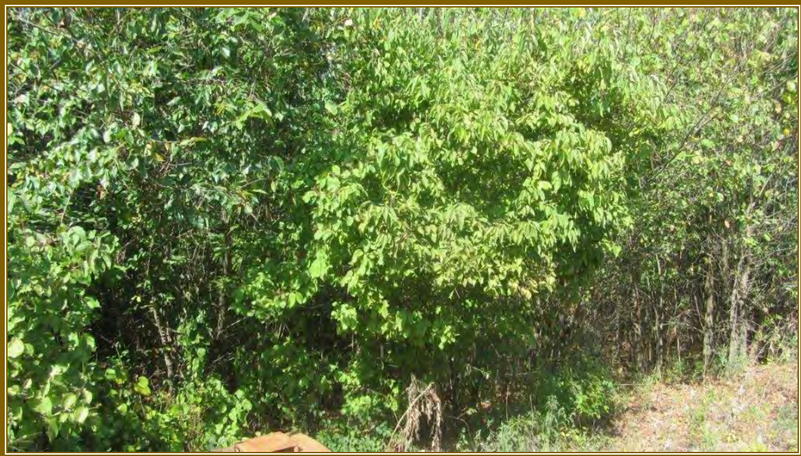
ABB Trap 2 and Habitat Surveyed